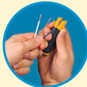
Strips wire carriers.