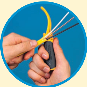
Clips sheathing clean.