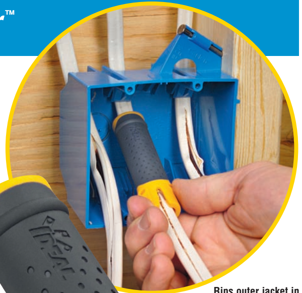
Rips outer jacket in hard to reach areas

Textured Santoprene™ Slip-Resistant Grip