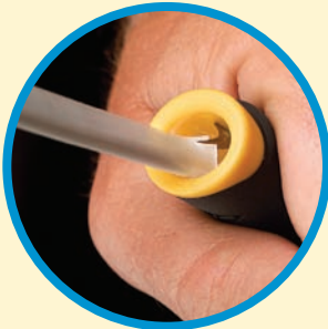
Insert Romex® into specially designed blade.