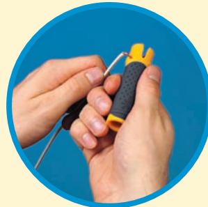
Loops wires for screw connections.