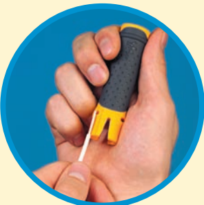
Strip length gauge guide.