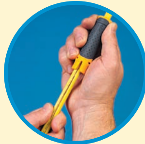
Rapidly rips Romex® Sheathing.