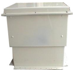
Pipe Chase Housing