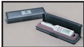
Hard Plastic Protective Case - protect your investment