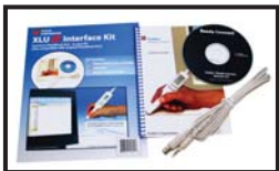
Computer Interface Kit - connects to any Windows™ application