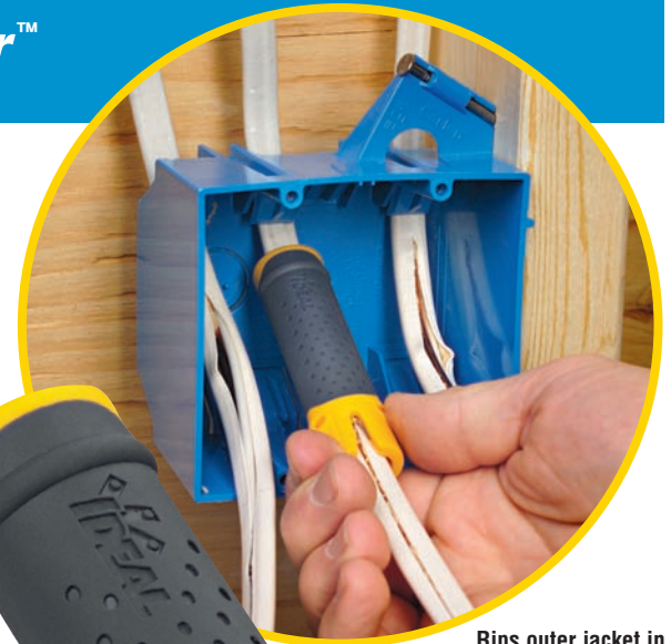
Rips outer jacket in hard to reach areas