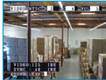
Video and sync level testing in IRE units (NTSC) or millivolts (PAL) and audio level testing with internal speaker and visible level scale. Available only in SecuriTEST PRO model.