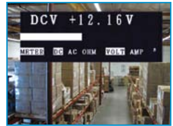
Full function digital multi-meter with large on-screen display tests AC/DC volts, AC/DC current, ohms and continuity. Auto and manual range selections