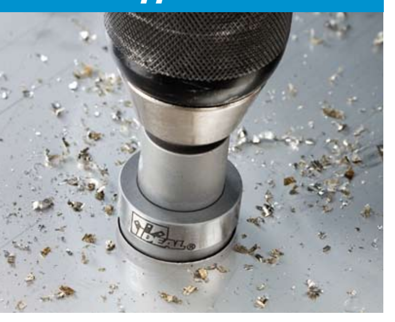
Quickly drills precise holes without penetration beyond sheet metal.

Introducing the new TKO <sup>™</sup> carbide tipped hole cutters from IDEAL INDUSTRIES, INC. TKO cutters offer the most efficient and clean cutter replacement for traditional knockouts, by making smooth holes in a fraction of the time at a fraction of the cost. Specifically designed to cut sheet metal, TKO cutters will even cut stainless steel with fine grained, carbide tips. The innovative design includes the exclusive SmoothStart<sup>™</sup> replaceable pilot drill, which guides the cutter to the surface, avoiding cutter damage and providing smoother holes. An integral overdrill flange prevents cutter penetration beyond the sheet metal. When it comes to quality, performance and durability, IDEAL is the professional's choice for carbide tipped hole cutters.