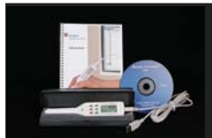
Scale-Link USB - Computer - Input Plan Scaler