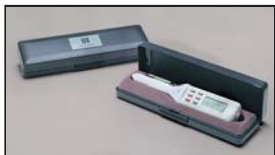
Hard Plastic Protective Case - Protect your investment